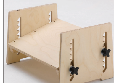
Independent adjustable footrest 1 ITEM # 4187 Portable, height and angle adjustable Solid support for the feet