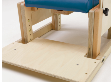
Reversible footboard 1 ITEM # FB023 - FB026 Provides foot support Prevents unwanted chair movement