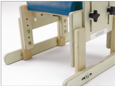
Skis ITEM # SK051 - SK054 Provides greater stability