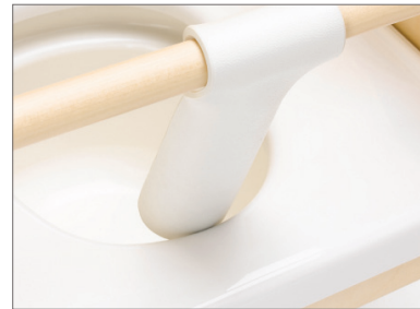
Splash guard ITEM # SG001 - SG002 Assists in leg abduction and keeps toileting contained Requires Toggle handrail