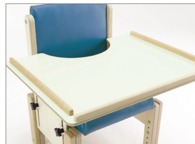
Tray ITEM # TR003 - TR006 Provides trunk support Additionally can be used for activities such as playing