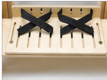
Footrest & straps 1 ITEM # FP002 - FP005 Ensures feet are firmly in position