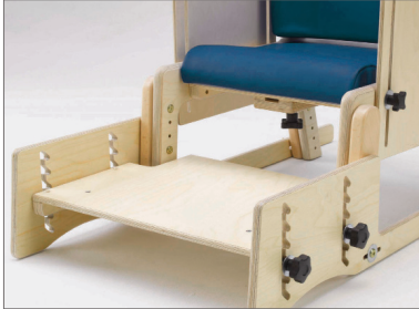
Skis & full footrest 1 ITEM # SK037 - SK040 Provides foot support and offers greater stability