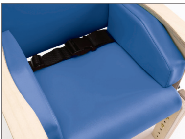
Pelvic cushions single or double thickness (pair) 2 Provides hip and thigh support Available in various sizes